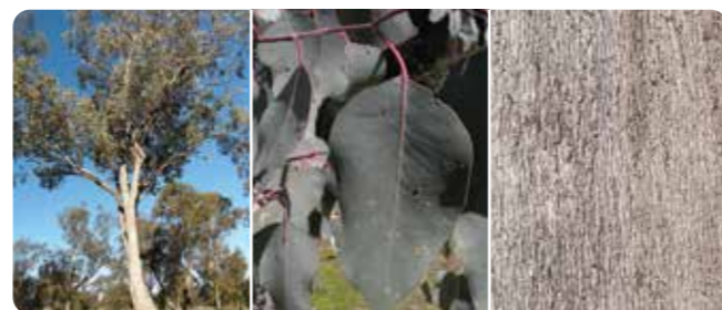
White Box Eucalyptus albens