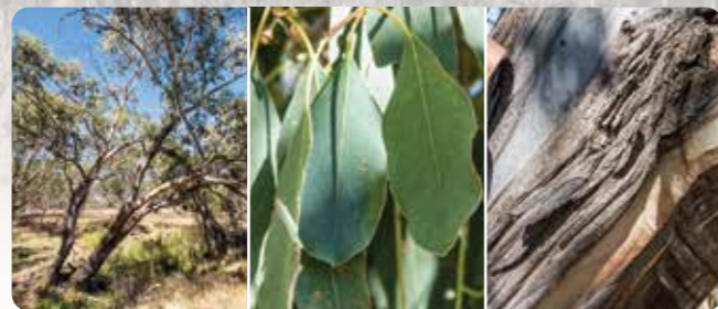
Swamp Gum Eucalyptus ovata Also present is Mountain Swamp Gum E. camphora