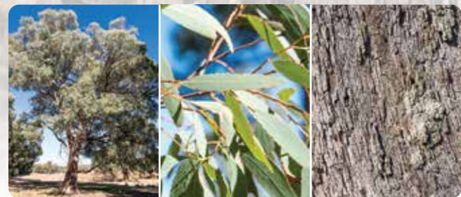
Narrow-leaved Peppermint Eucalyptus robertsonii