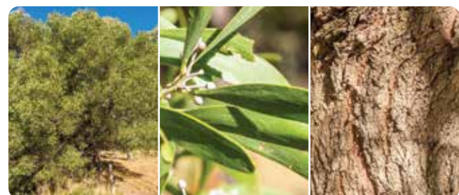
Blackwood Acacia melanoxylon