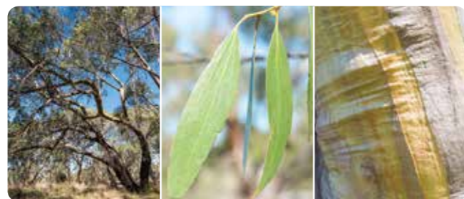
Black Sallee Eucalyptus stellulata