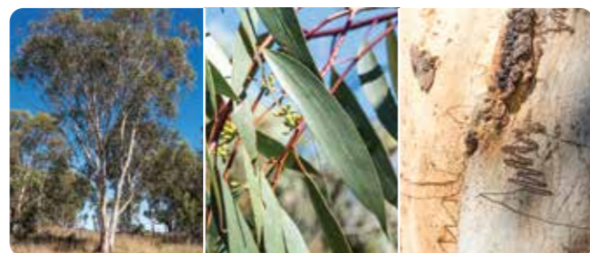
White Sallee/Snow Gum Eucalyptus pauciflora