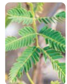
Blackwood juvenile leaves