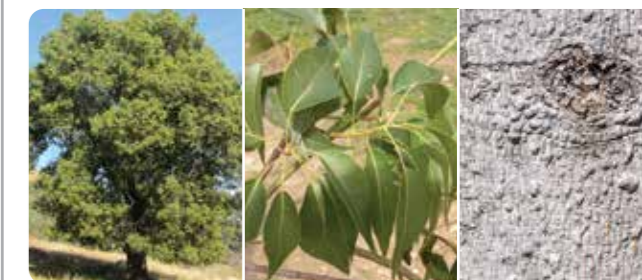
Kurrajong Brachychiton populenus

Note: in the northern edge of the Murray region this species is often replaced by Scribbly Gum ( E. rossii )