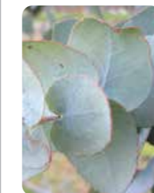
Apple Box juvenile leaves

Some trees, such as Apple Box and Long-leaved Box, look similar in their adult form. The juvenile leaves help to narrow down the species as juvenile Apple Box leaves are crenulated and alternate, whilst Long leaved Box are opposite and smooth. Other examples that have markedly different juvenile leaves are Kurrajongs and Eurabbies and some Wattles. Peppermints can also be separated by their juvenile leaves.