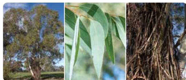
Ribbon Gum/Manna Gum Eucalyptus viminalis