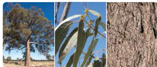
Grey Box Eucalyptus macrocarpa