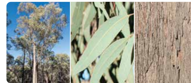
Broad-leaved Peppermint Eucalyptus dives

Silver Bundy (E. nortonii) is a very similar species characterised by glaucous (white waxy) buds that is also common in dry sclerophyll forest.