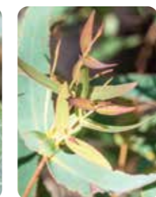
Narrow-leaved Peppermint juvenile leaves