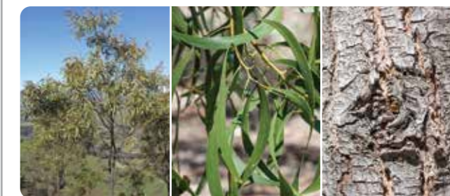
Hickory wattle/Lightwood Acacia implexa