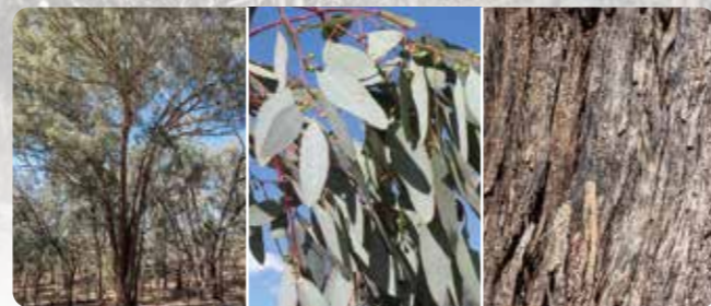
Yellow Box Eucalyptus melliodora