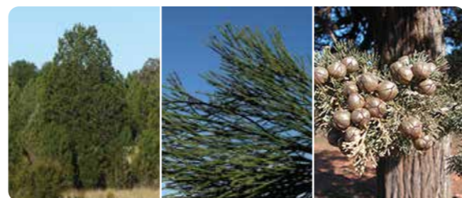
Cypress Pine Callitris species; in the east generally Callitris Endlicheri , central is Callitris Glaucophylla Stand of Black Cypress Pine, Black Cypress Pine leaves, White Cypress Pine bark and nuts