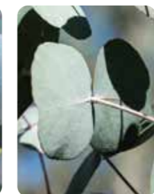
Long-leaved Box juvenile leaves