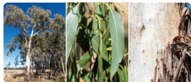
Candlebark Eucalyptus rubida