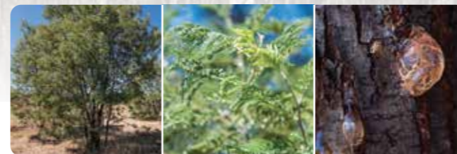
Silver Wattle Acacia dealbata

Throughout the Slopes to Summit region Some overstorey species can be seen right across the region. Their form can vary dependant on the position in the landscape, rainfall and soil fertility.