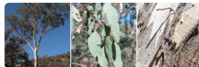
Blakely's Red Gum Eucalyptus blakelyi Note: there are at least two other forms of Red Gum present in our catchment – E. dwyerii and E. dealbata. These both occur on steep, rocky hills and are smaller, often multi stemmed and can be identified by the arrangement and shape of the buds.