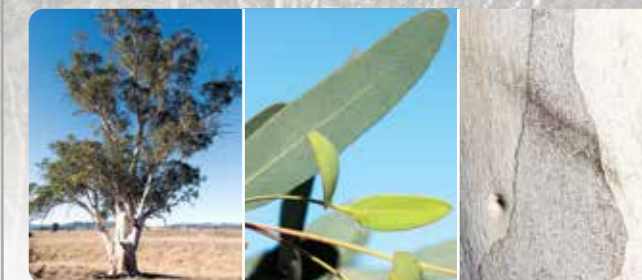
Brittle Gum Eucalyptus mannifera

Note: in the northern edge of the Murray region this species is often replaced by Scribbly Gum ( E. rossii )