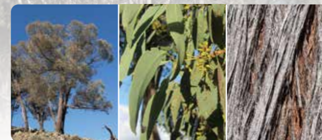
Red Stringybark Eucalyptus macrorhyncha