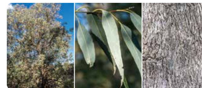
Long-leaved Box Eucalyptus goniocalyx

Silver Bundy (E. nortonii) is a very similar species characterised by glaucous (white waxy) buds that is also common in dry sclerophyll forest.