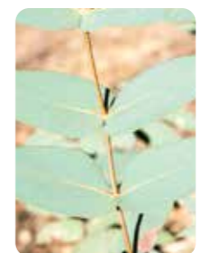
Broad-leaved Peppermint juvenile leaves

Buds and Bark are useful identification markers. Brittle Gum is often identified by its smooth, white powdery bark which comes off on your hands when rubbed.