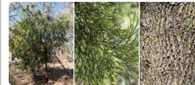
Cherry Ballart/Native Cherry Exocarpos cupressiformis