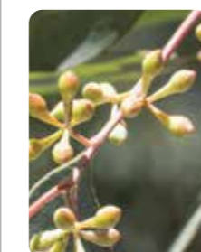
Yellow Box buds

Buds and Bark are useful identification markers. Brittle Gum is often identified by its smooth, white powdery bark which comes off on your hands when rubbed.