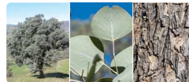
Red Box Eucalyptus polyanthemus