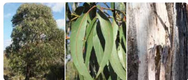
Eurabbie Eucalyptus bicostata