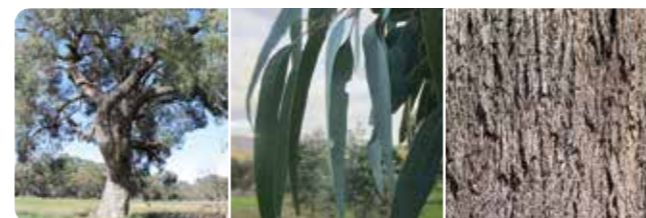
Apple Box Eucalyptus bridgesiana