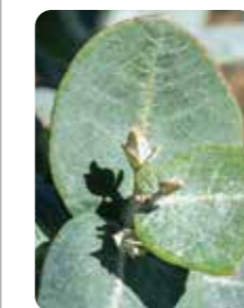
Eurabbie juvenile leaves