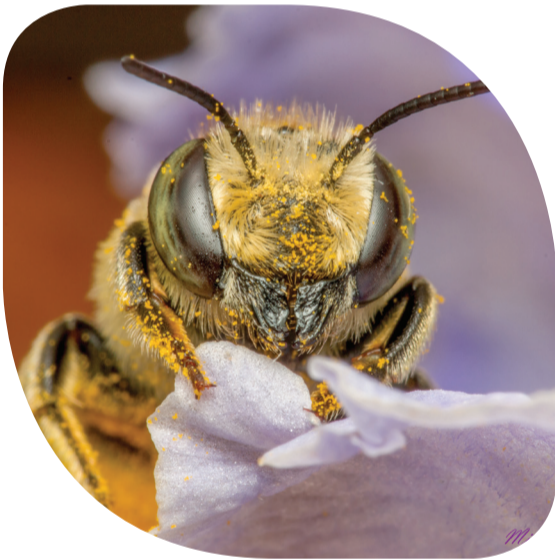
Leafcutter Bee burrow, Megachile maculariformis Megachile leafcutter